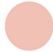
Dusty Pink 14-1316 TCX