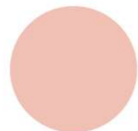
Dusty Pink 14-1316 TCX