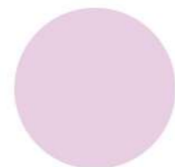
Lavender Fog 13-3820 TCX