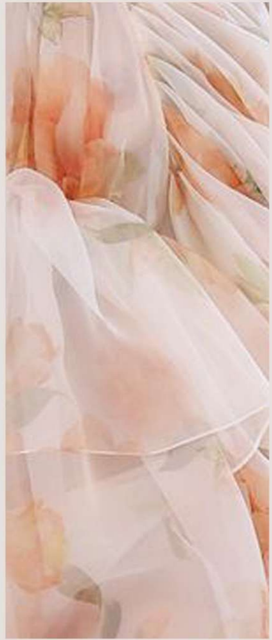
TOPS, SKIRTS & DRESSES