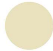
White Smoke 12-0704 TCX