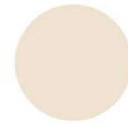
Lemon Icing 11-0515 TCX