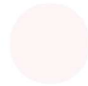
Snow White 11-0602 TCX