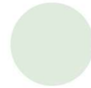
Ambrosia 12-0109 TCX