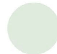
Ambrosia 12-0109 TCX