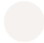
Baby Powder 11-0501 TCX

Capturing the charm of the decorated array of the pastel hued houses of Notting Hill, this fabric collections renders a sense of fresh optimism. The sorbet palette is the perfect way to kick start summer.