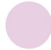
Lavender Fog 13-3820 TCX