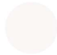
Brilliant White 11-4001 TCX