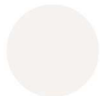
Baby Powder 11-0501 TCX