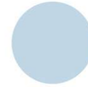
Delicate Blue 10-4202 TCX