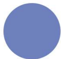
Persian Jewel 17-3934 TCX