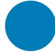
Ibiza Blue 17-4245 TCX