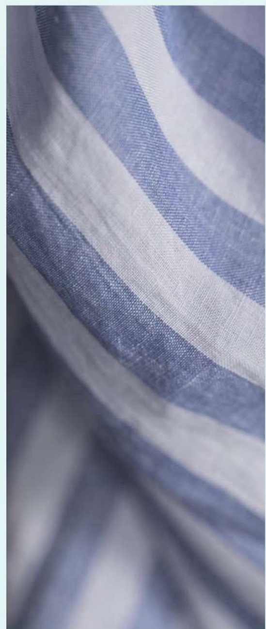
TOPS, SKIRTS & DRESSES