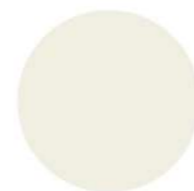
Cannoli Cream 11-4302 TCX