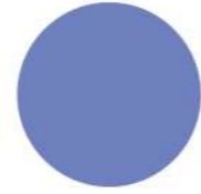
Persian Jewel 17-3934 TCX

Drawing inspiration from the soulful promenades, magnificent sandy coastline and colorful beach houses. The blue & white Portuguese tile patterns and striped houses come together in blissful harmony to shape the fabrics for June.