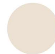
Eggnog 12-0601 TCX