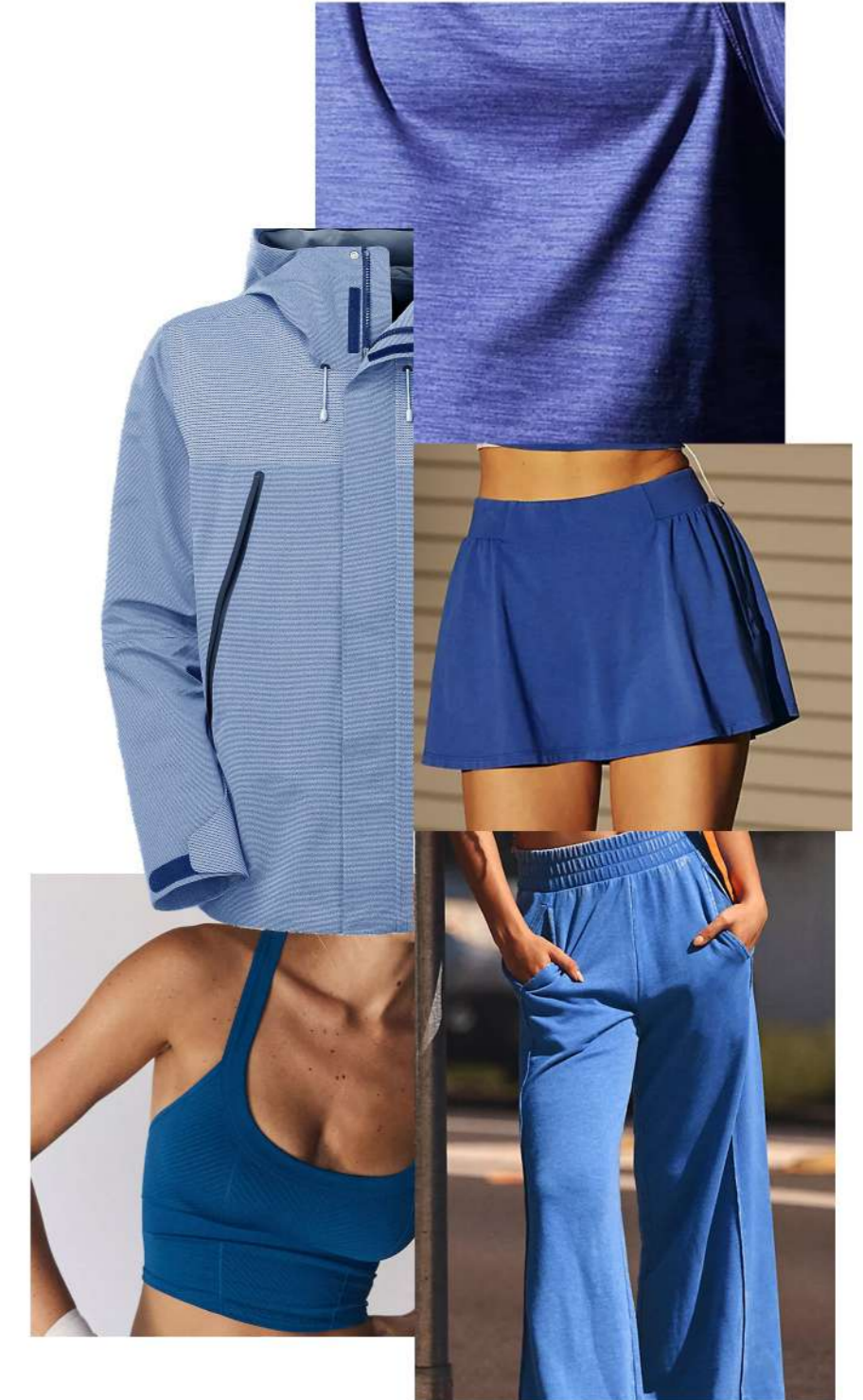
CHAMBRAY/ YARN DYED TEXTURES