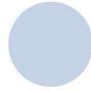
Ice Water 13-4202 TCX