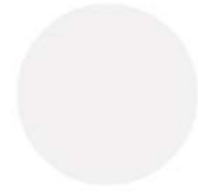
Bright White 11-0601 TCX