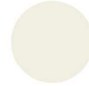
Cannoli Cream 11-4302 TCX